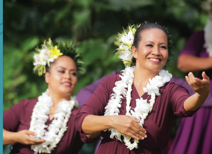
Hula by Hālau Ka Lei Mokihana o Leinā'ala Hō'ike