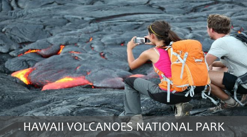
HAWAII VOLCANOES NATIONAL PARK