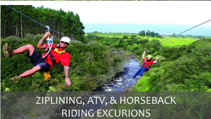
ZIPLINING, ATV, & HORSEBACK RIDING EXCURSIONS