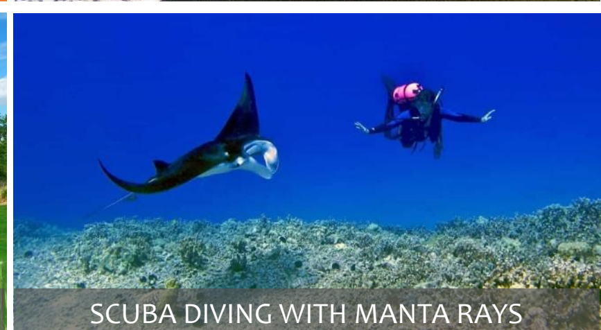
SCUBA DIVING WITH MANTA RAYS