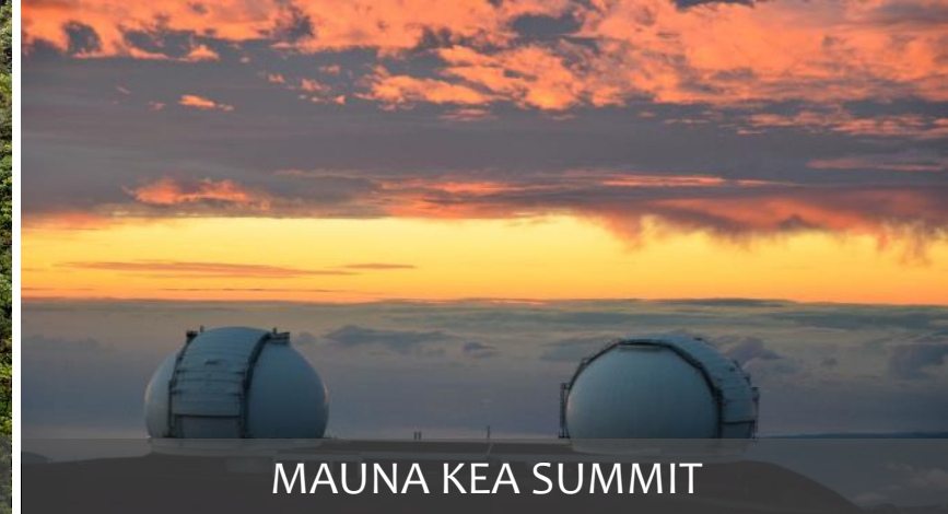
MAUNA KEA SUMMIT