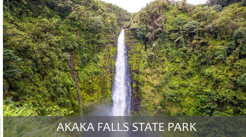
AKAKA FALLS STATE PARK