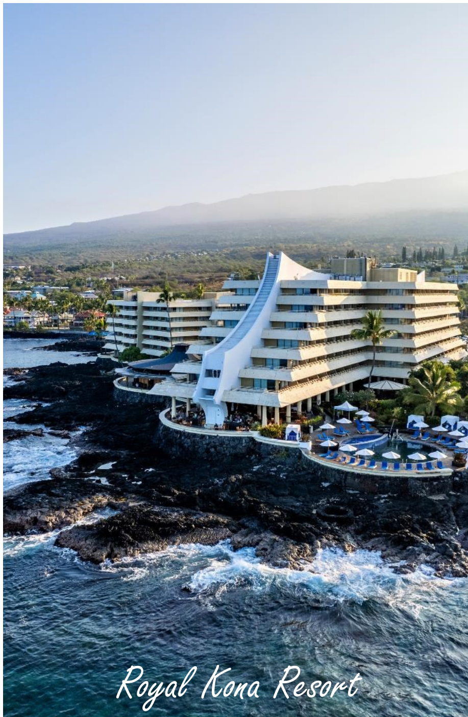
Royal Kona Resort