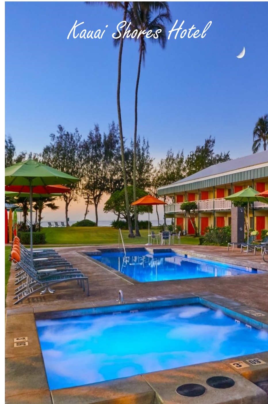
Kauai Shores Hotel