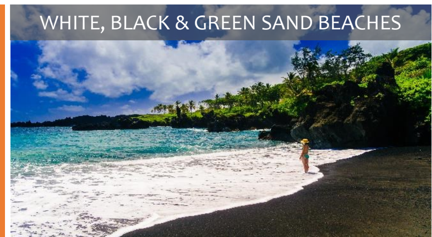
WHITE, BLACK & GREEN SAND BEACHES