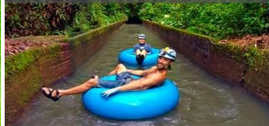
TUBE DOWN OLD SUGAR CANE RIVER