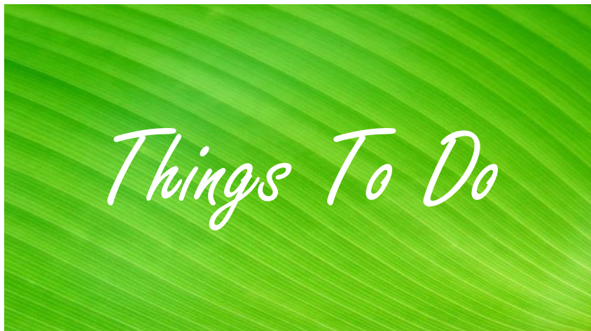
KAUAI COFFEE ESTATE